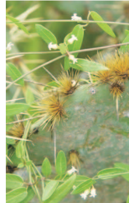
Cynanchum barbigerum , Thicket Threadvine on Prickly Pear