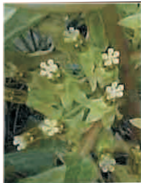
Hierba de Zizotes, herbaceous milkweed found in old field and coastal roadways

For more information on the varied milkweed species residing in the valley, I refer you to the Native Plant Project’s newly-published handbook. Butterfly Gardening with Native Plants of the Lower Rio Grande Valley, TX.