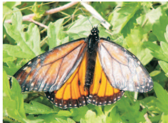
Wet, newly-hatched Soldier. Hostplants include several milkweed species.