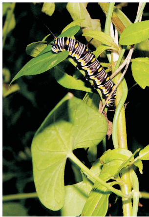
Queen larva munching on Twine Vine, Sarcostemma cynanchoides , a preferred host