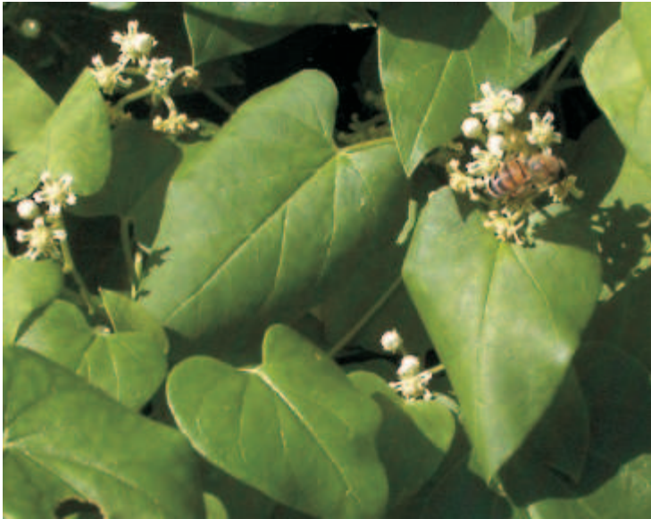
above: Cynanchum racemosum . Note the smooth leaves and tiny, five-pointed starlike blooms.