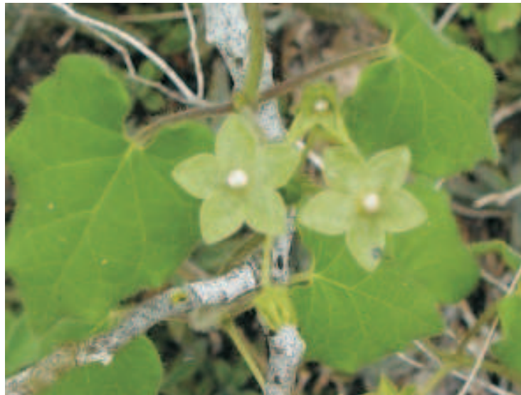
Pearl Milkweed Vine, Matelia reticulata , photographed in Arroyo Colorado brush understory.